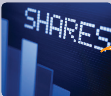
Donation of shares

Helen & Douglas House is delighted to have a number of supporters who donate unrestricted gifts to the charity. This allows us to spend their donations on any area of work that is of immediate priority. Gifts can be made in many ways.