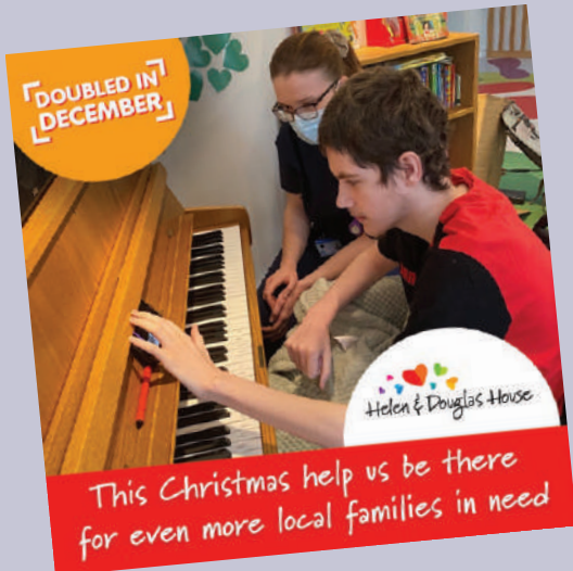
Our Christmas Appeal

Our Outreach Service provides a seamless link for children and their families between the hospice, the hospital, their GP and home. Our nurse specialists and doctors visit families in their own homes and are available 24 hours a day, 365 days a year with help and advice over the phone.