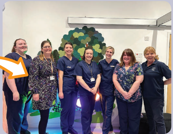
Some of our amazing nursing team

One of the reasons we can offer such high quality support to families is our one-to-one care. Whether it be a Nurse at the hospice or one of our Community and Family Support Services team, we are able to offer individualised care tailored around each families needs.