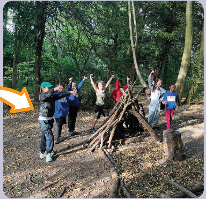
Siblings at an activity camp

At Helen & Douglas House we provide support for the whole family. Often siblings feel isolated and anxious because they have no one to talk to and no one who understands how they are feeling. So, we offer 1:1 sessions, group sessions, activity camps and trips, to help siblings cope and to form peer to peer relationships with others going through a similar experience.