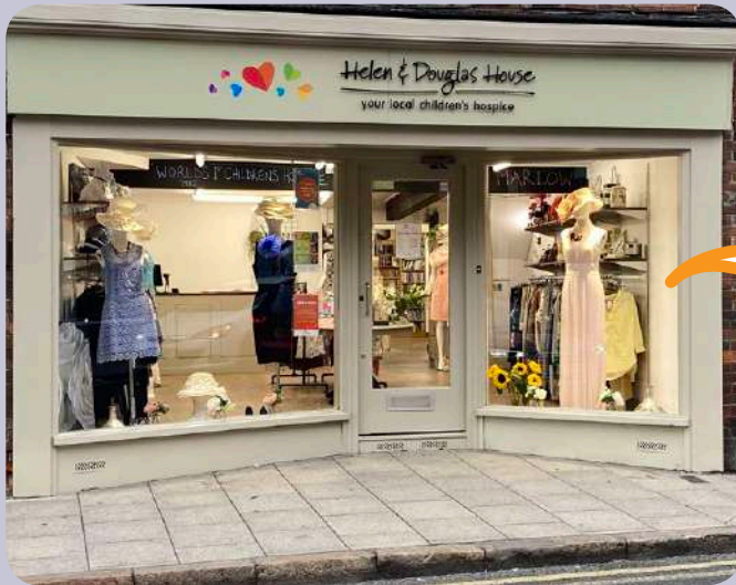
Our Marlow shop

One of the reasons we can offer such high quality support to families is our one-to-one care. Whether it be a Nurse at the hospice or one of our Community and Family Support Services team, we are able to offer individualised care tailored around each families needs.