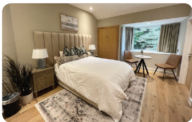
Our new flexible family space bedroom for parents

The creation and re-development of our new flexible family space and Little Room would not have been possible without donations from Ian and Mave Richens, B&Q Foundation,