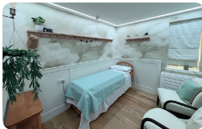
The Little Room where a child can stay after they have died