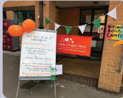
Ultimate Activity Camps fundraising