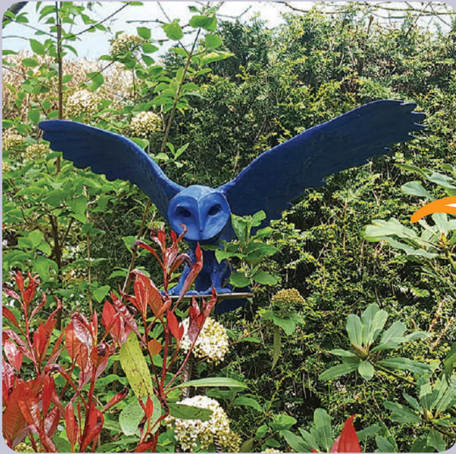
One of the sculptures at the Kingham Sculpture Exhibition

At Helen & Douglas House we provide support for the whole family. Often siblings feel isolated and anxious because they have no one to talk to and no one who understands how they are feeling. So, we offer 1:1 sessions, group sessions, activity camps and trips, to help siblings cope and to form peer to peer relationships with others going through a similar experience.